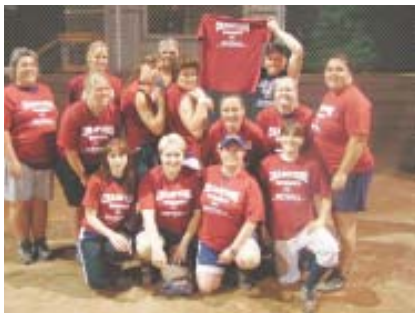
Scotts Automotive Summer 2011 Women's Champs

Get involved with the adult softball league—GDRD partner group Divide Recreation Association (DRA) is