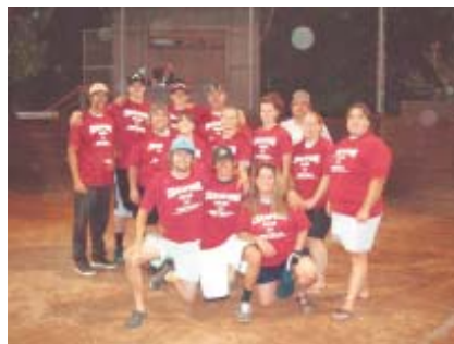
Buffalo Saints Summer 2011 Co-Ed Champs